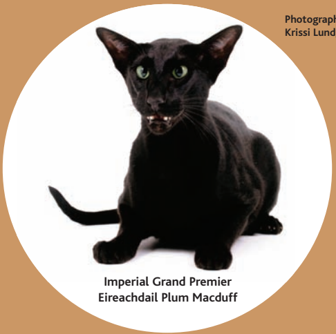
Imperial Grand Premier Eireachdail Plum Macduff

Breeders attracted by the lithe elegant type of the Siamese cat removed the gene for Siamese colour distribution by selective breeding, producing a whole new breed of animal we now know as the Orientals. These retain the lovely length and elegance of the Siamese type but have no contrasting body pallor. And whereas the Siamese eyes are a striking deep blue, that of the Orientals is green, which at its best is quite stunning. They come in all the colours that Siamese exhibit in their points though the analogue of the Siamese seal appears as deep true black in the Oriental. There is also a white variety with blue eyes (due to a gene that is quite different from the partial albino that codes for Siamese pattern), the Foreign White. There are Tortie and Tabby varieties of Oriental, but the presence of pattern on the body allows us to distinguish between spotted, classic and ticked forms of tabby, not the case with the Siamese in which pattern is confined to the points where these distinctions are not easily made.